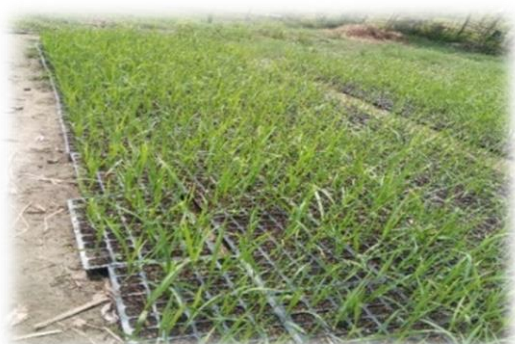
Grown up settlings in protrays on farmer's