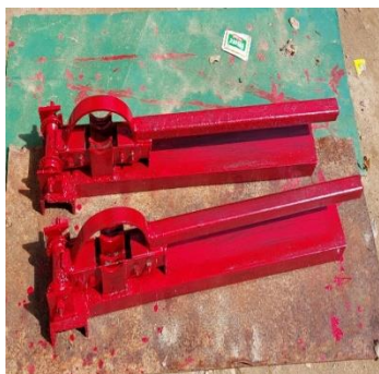
Single bud cutter