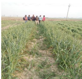
Sugarcane + Wheat