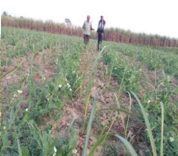
Sugarcane + Field pea