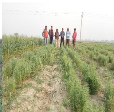
Sugarcane + Lentil