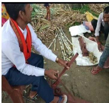
Bud cutting by farmer through single bud cutter