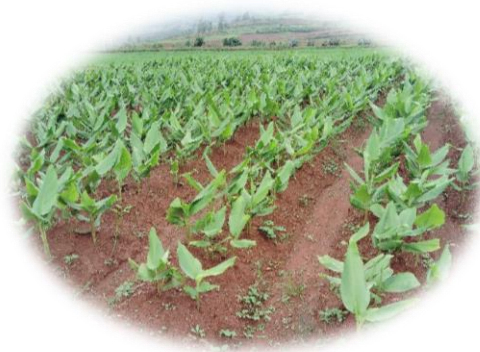
Field view of Curcuma amada

Mango ginger ( Curcuma amada Roxb.) is a significant member of the genus Curcuma and is referred to as such because of its raw, unripe mango-like scent and physical resemblance to ginger ( Zingiber officinale ). The term "amada" refers to the rhizome that has the distinct flavor of an unripe mango and is derived from the Bengali word "mango ginger." Mango ginger is a well-known aromatic plant used as mango flavoring as the rhizomes of mango ginger have the smell of raw-mango.