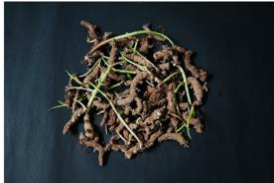
Rhizomes of Curcuma amada